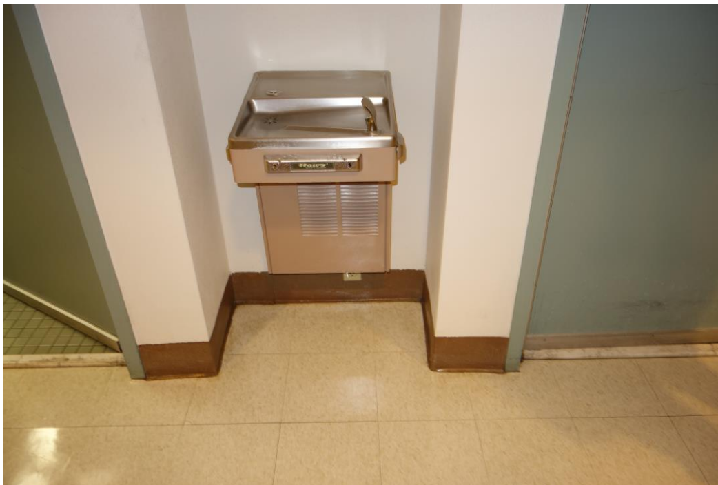
Nevada State Library & Archives - Building #1675 Description: Dual Level Drinking Fountains Needed.