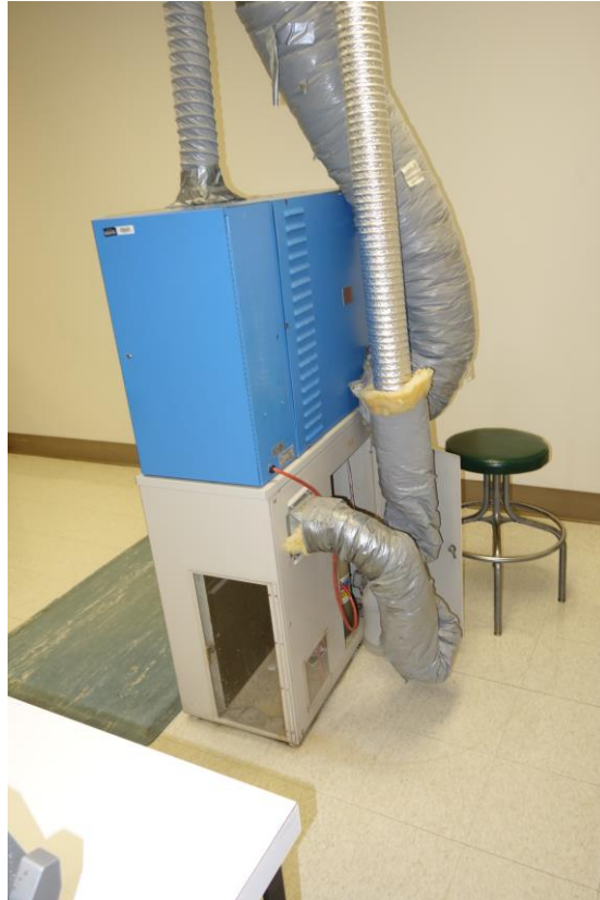
Nevada State Library & Archives - Building #1675 Description: Equipment & Venting Removal Recommended.