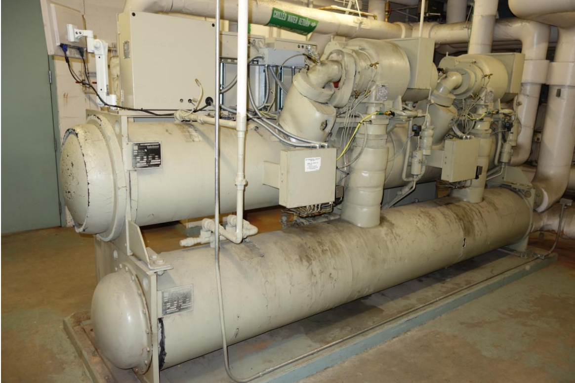
Nevada State Library & Archives - Building #1675 Description: Replacement of Chiller & Central Plant Needed.