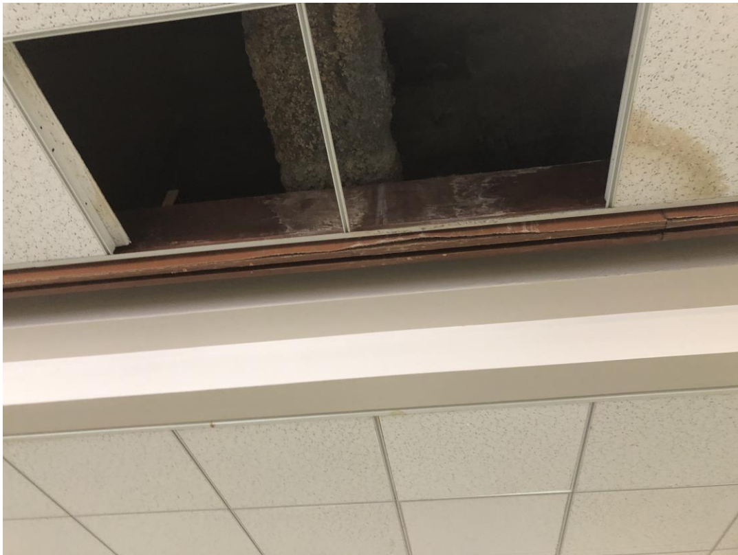
Nevada State Library & Archives - Building #1675 Description: Ceiling Condition in Old Talking Books Room.