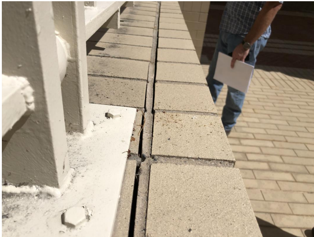
Nevada State Library & Archives - Building #1675 Description: Stainless Steel Flashing Caps for Masonry Guard Rails.