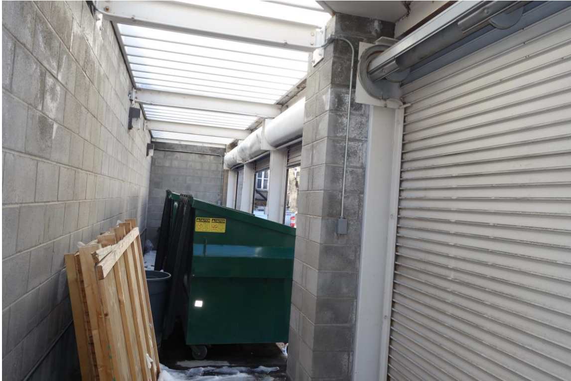
Nevada State Library & Archives - Site #9866 Description: Overhead Door Replacement Needed.