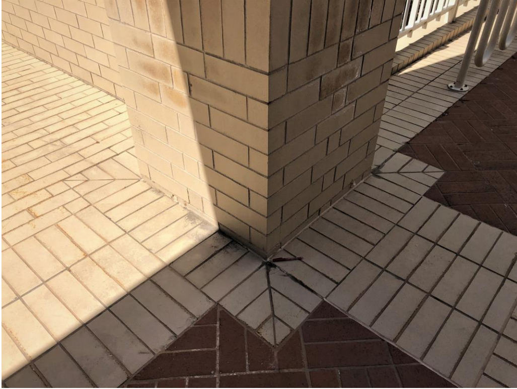
Nevada State Library & Archives - Building #1675 Description: Building Leak Repairs West Side Patio (Pic 2 of 2).