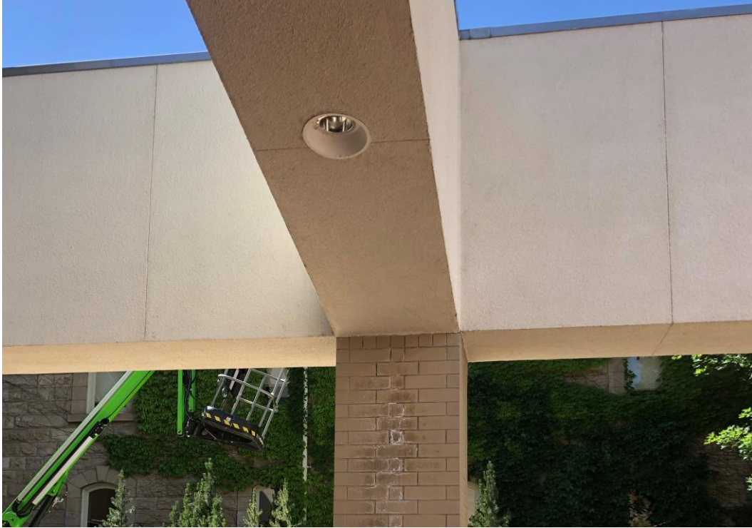
Nevada State Library & Archives - Building #1675 Description: Stucco Repairs Needed.