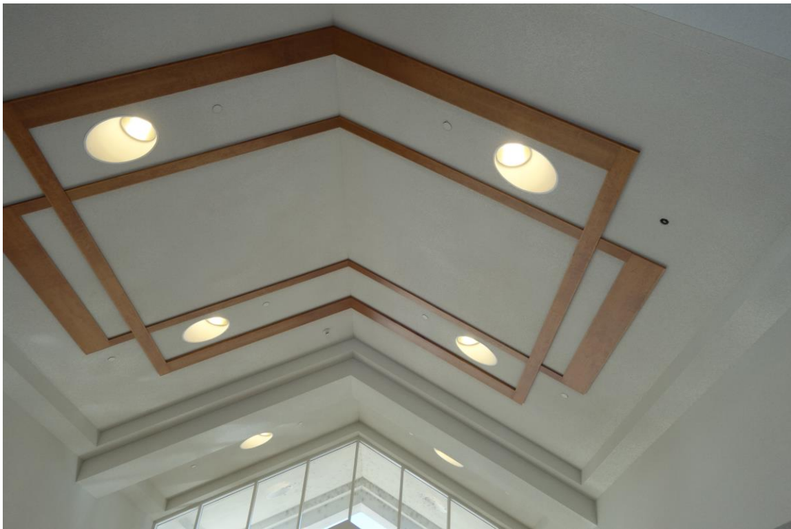
Nevada State Library & Archives - Building #1675 Description: Lighting Upgrade to LED Recommended.