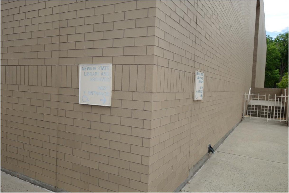
Nevada State Library & Archives - Site #9866 Description: ADA Site Path of Travel Signage Replacement Needed.