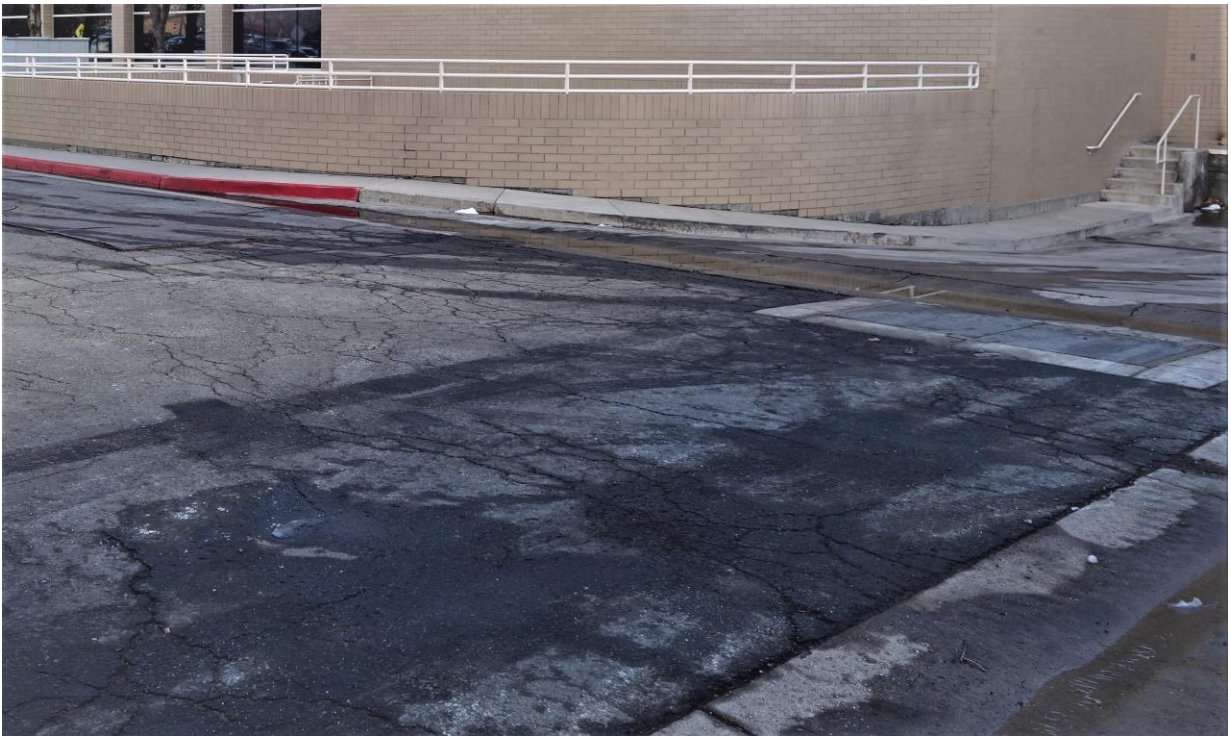
Nevada State Library & Archives - Site #9866 Description: Pavement Replacement Needed.