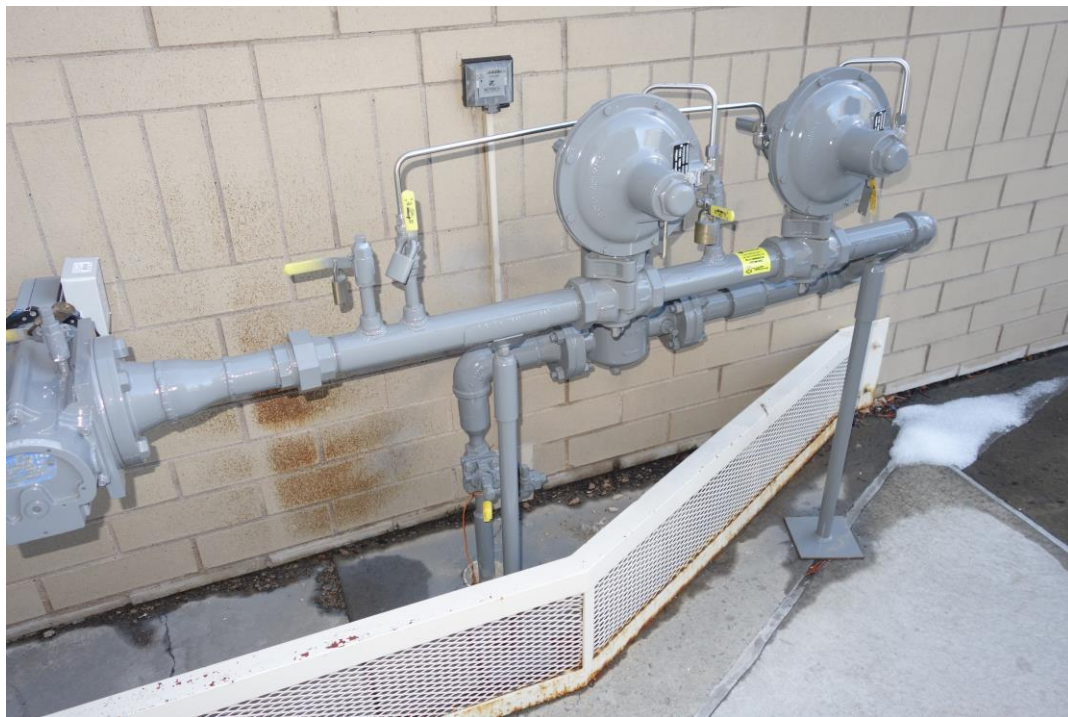
Nevada State Library & Archives - Building #1675 Description: Seismic Gas Valve Installation Needed.