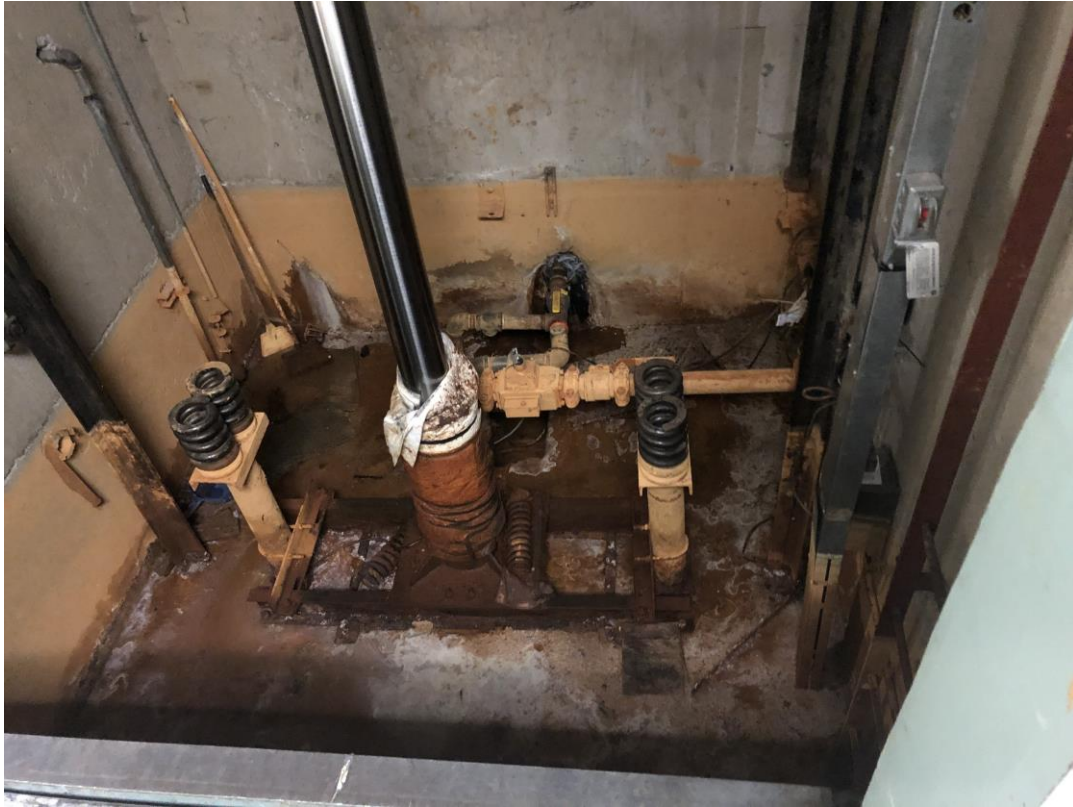
Nevada State Library & Archives - Building #1675 Description: Elevator Sump Repairs.