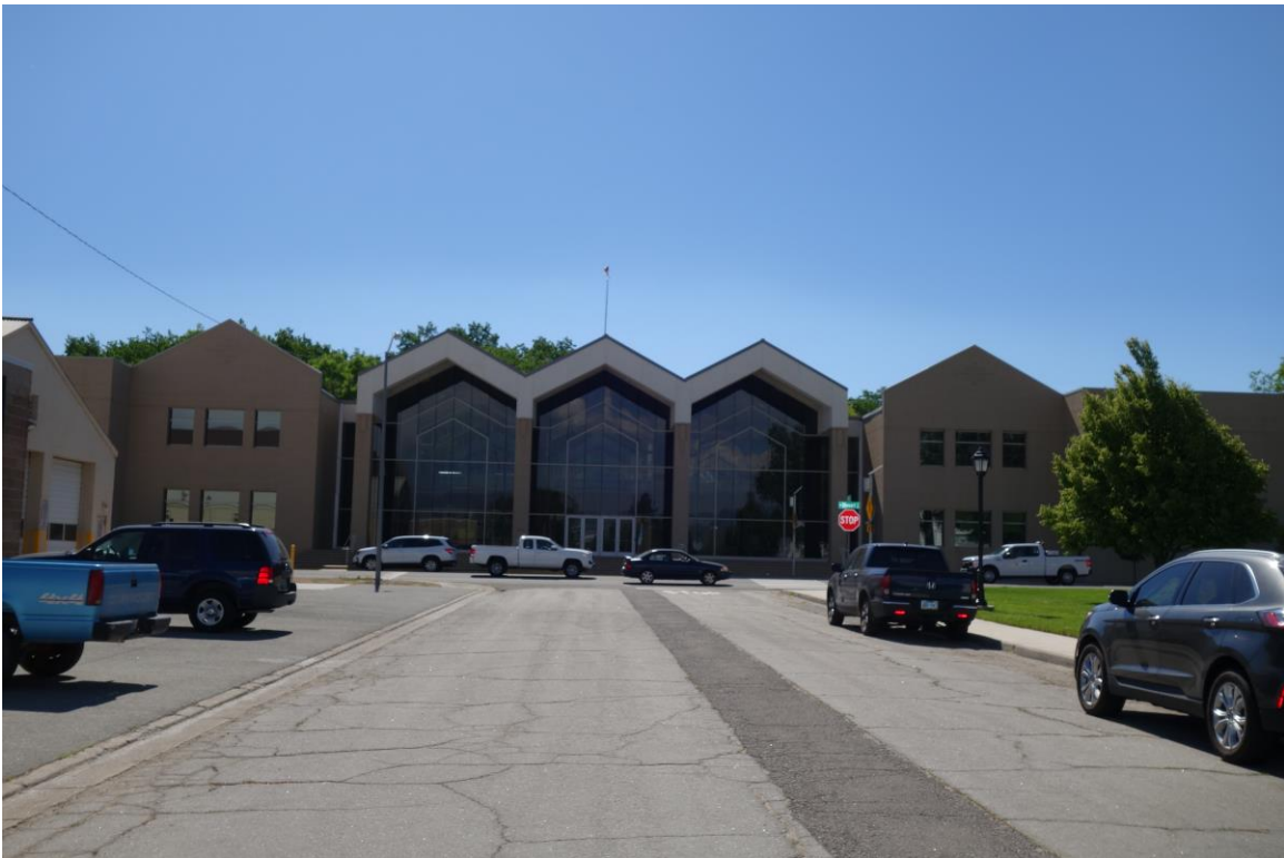
Nevada State Library & Archives - Building #1675 Description: East Public Entrance