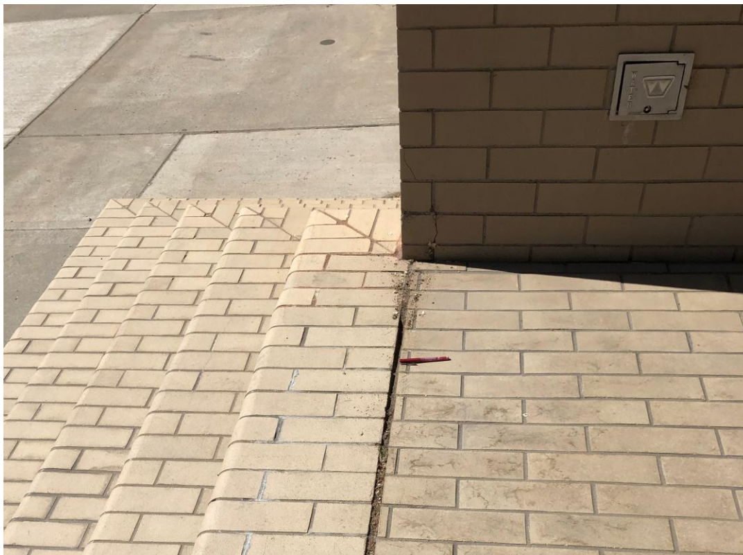
Nevada State Library & Archives - Building #1675 Description: Building Leak Repairs East Side Patio.